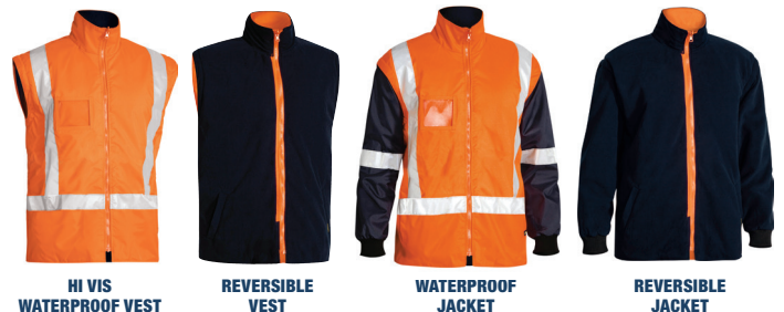
HI VIS WATERPROOF VEST